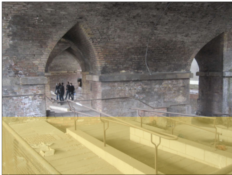
EXAMPLES OF VARIATION IN FLOOR LEVEL AND FINISH - It is proposed to construct new floor slabs in excavated units to bring shop units up to same level as the existing London Road Level. Existing hard landscaping materials in London Road (cobble, setts, railway lines etc) to be lifted and relaid. Refer to Spacehub drawings for proposals. Ramps in yellow to be removed